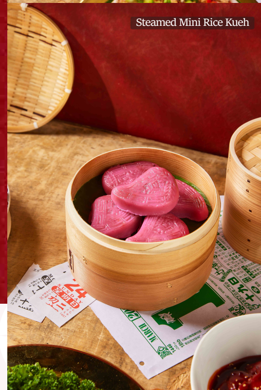
Steamed Mini Rice Kueh