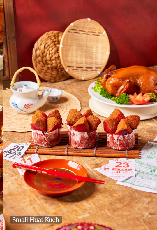
Small Huat Kueh