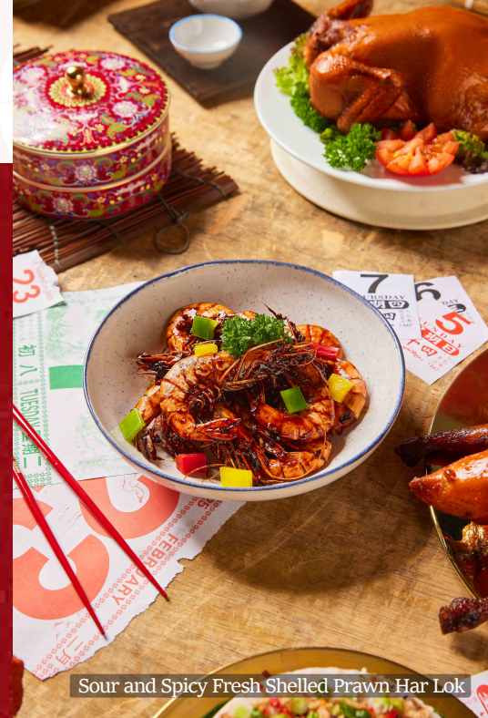
Sour and Spicy Fresh Shelled Prawn Har Lok

Big Huat Kueh (approx. 600g) $7.00 ($7.63 with GST)